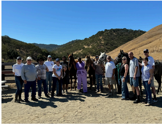
A Gorgeous Day and Gorgeous Horses