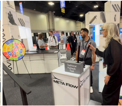
AOPA Conference in NC

Talking Horses: We had an incredible day at the Hollister Horseback Riding event! For those who haven't attended, it's a truly unique experience. Families enjoyed quality time together, while some came just to watch and interact with the magnificent horses. Others were excited to rekindle their childhood passion for riding. The atmosphere was filled with joyful smiles, and although the afternoon fatigue was real, the excitement of the day left an unforgettable impression on everyone involved! The link above shows video highlights.