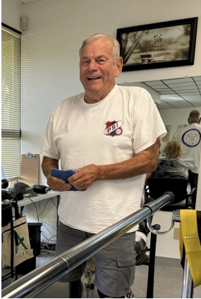
Getting his Game On